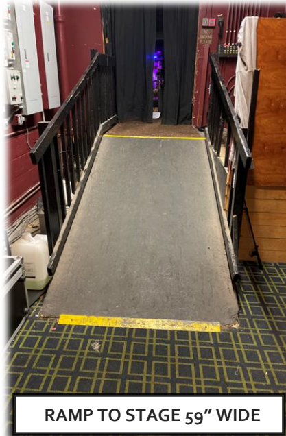
RAMP TO STAGE 59" WIDE