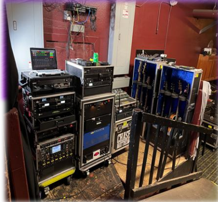
STAGE RIGHT WING 66" X 119"