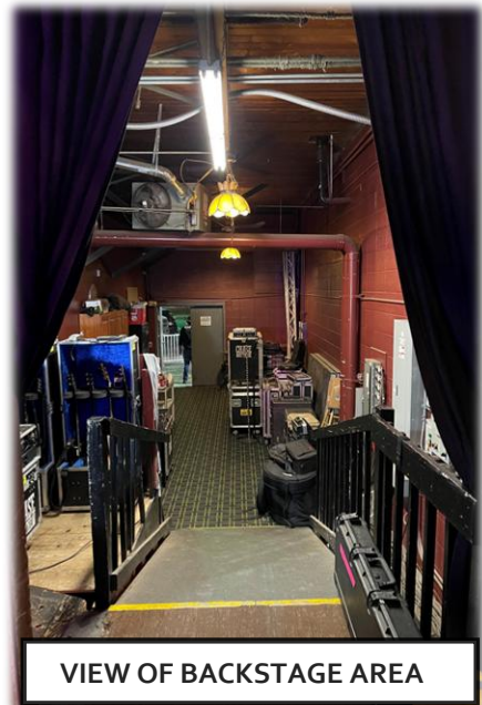
VIEW OF BACKSTAGE AREA

Bus parking area can usually accommodate 3 wide of busses or semi-trailers. If you require more parking, please inform us during the advance and we will dour best to accommodate.