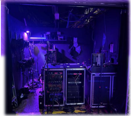
STAGE LEFT WING 78" X 107"