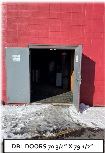
DBL DOORS 70 3/4" X 79 1/2"